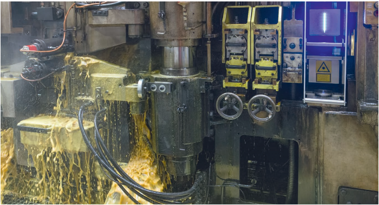
Only 200 mm length are required for the installation of the thickness measuring system

precision. The VTLG thus opens up completely new possibilities for quick and precise thickness control and for quality assurance. With an internal scanning rate of 50 kHz, the scalable analogue output provides the input signal for high-speed thickness control within milliseconds.